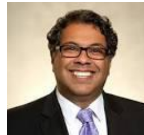
August 2017 A MESSAGE FROM MAYOR NENSHI

On behalf of the citizens of Calgary and my City Council colleagues, it is my pleasure to welcome you to the Calgary 55 Plus 2017 Provincial Championships.