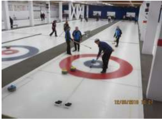
2019 Playoffs for Ice Curling in Zone 3